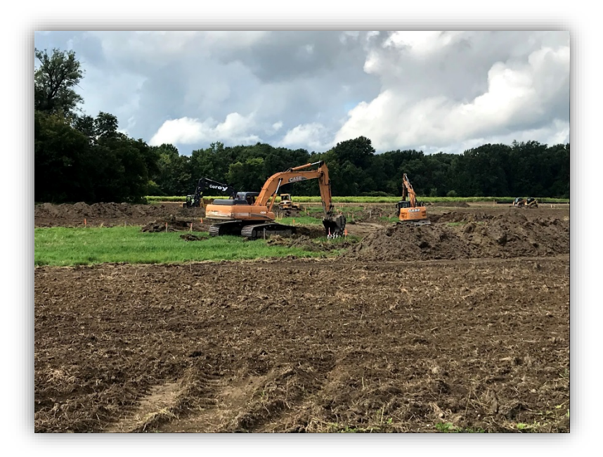
Wetland construction at Three Mile Bridge Rd, Middlebury Vermont

Annual Report – January 1, 2018 – December 31, 2018